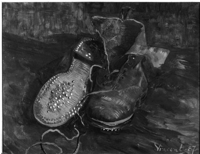
8. Shoes , a painting by Vincent van Gogh