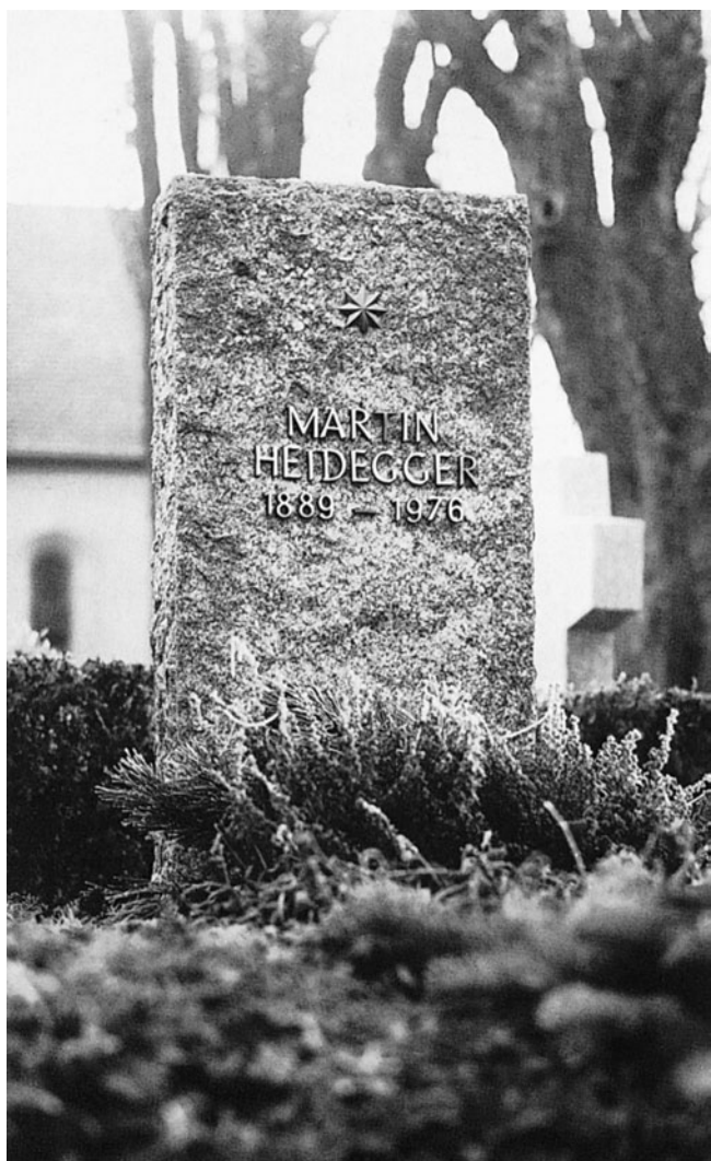
10. Heidegger's grave in the Messkirch cemetery