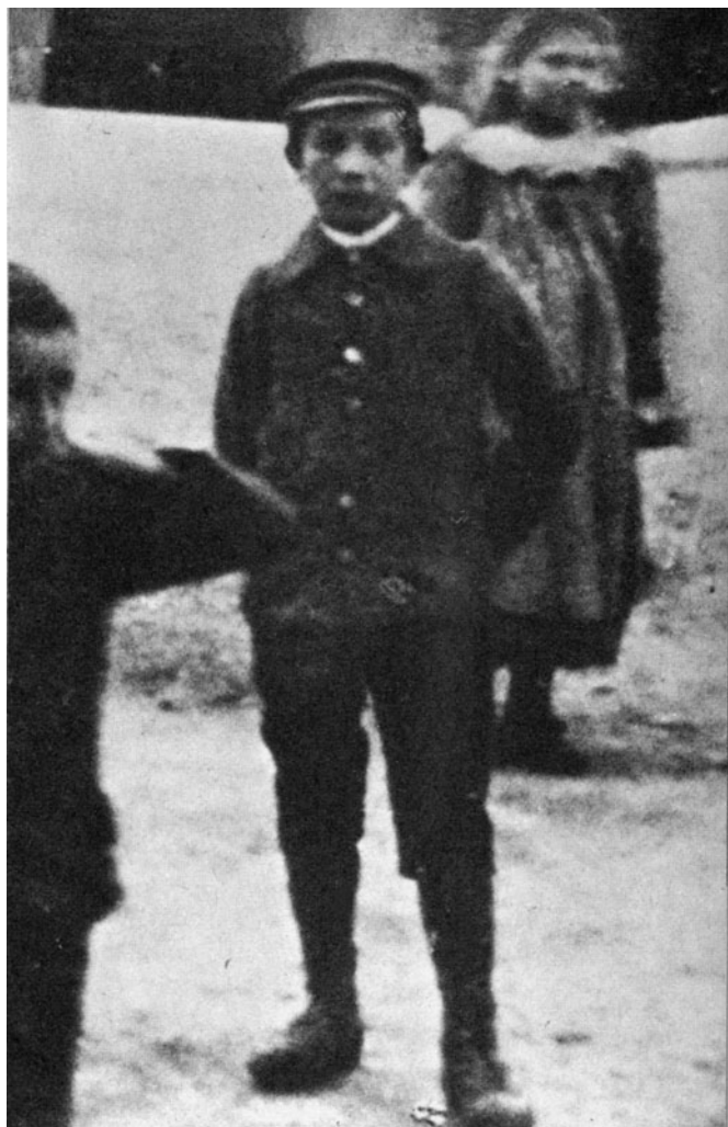
2. Heidegger as a schoolboy, in about 1899