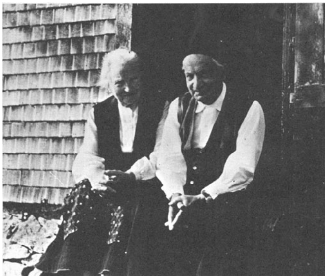
6. Heidegger with Elfride at their cottage in October 1969

unchanging, eternal (or eternally present ) forms or ideas, and not to things that ‘become’, arise, fade, and die away. But Heidegger has not here given us such a reason.