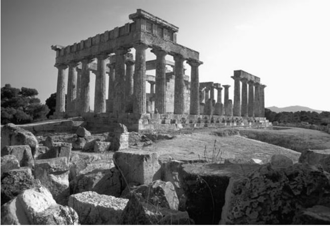
9. The Temple of Aphaia in Aegina, c.500 BCE