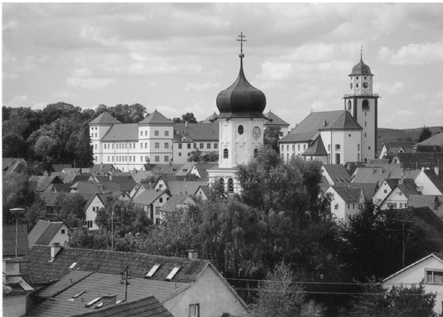
1. The town hall and market square of Messkirch