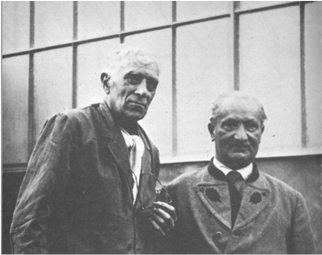
5. Heidegger with Georges Braque, Varengeville, 1955

disclosing the world of a film conveys the mood of the film – contentment, excitement, anxious expectancy, or average everydayness. But it is only in films that moods need music. We bring our own moods to the world without special aids.